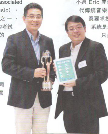
e-zone school / 09

英國皇家音樂院考試 ABRSM (Associated Board of the Royal Schools of Music)，是全球認受性最高的音樂考試之一，《AURALBOOK》便以其 1 至 8 級的考試作大綱，針對性練習音樂考試中所需的技巧，例如：歌唱音頻、拍手節奏、聆聽音樂等，於平板機中教授內容及提供練習，並以麥克風接收同學的表現，配合人工智能評分系統，分析音準及節拍，即使是半度的差別亦能辨別，為同學提供評分及建議。此外，同學更可將程式中的練習成績，儲存於雲端伺服器之中，讓同學隨時查閱重聽，了解自己的學習進度及水平。